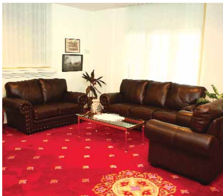
▲ Arbitrator's lounge