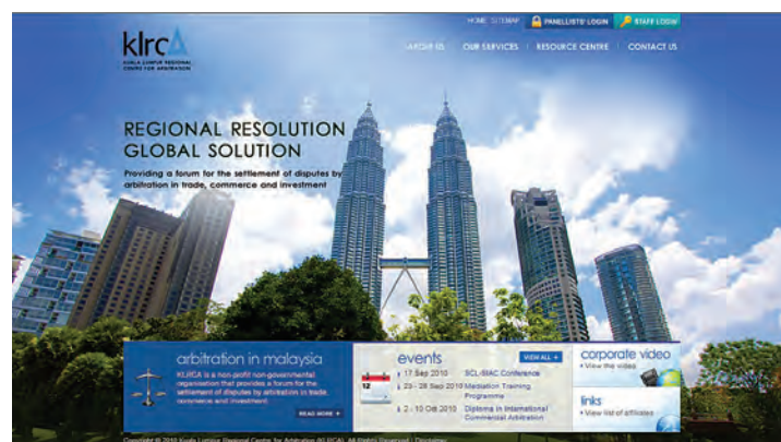
▲ KLRCA's new interactive website

As Internet has become an integral part of marketing strategies, KLRCA has revamped its website to be more informative, visually arresting and user friendly. A brand new corporate video, which showcases the facilities and services available at the centre, is downloadable from the website. Visitors to the website can also