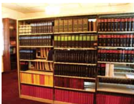
▲ Resource centre

KLRCA's new rules of arbitration adopt the latest UNCITRAL Arbitration Rules as of August 2010 with modifications. The new rules have a number of benefits for both local and foreign businesses. From a procedural standpoint, benefits include a shorter time frame for the arbitrator or arbitral tribunal to render its final judgement (award) from three to nine months. In terms of appointment of the arbitrator or arbitral tribunal, the selection of the arbitrators can be done within 48 hours.