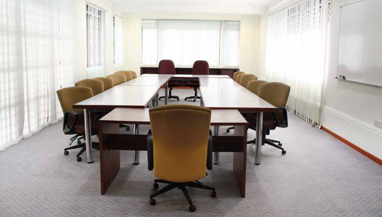
▲ Hearing room

download all the relevant Rules together with the necessary information, guidelines and documentations to start a proceeding for arbitration, mediation, conciliation and domain name dispute resolution.